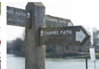
Residential moorings on the Thames at Shepperton - Towpath